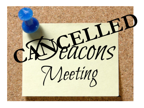
Please note the Deacons Meeting is canceled for the month of June.

Call 210-632-6018 FOR MORE INFORMATION, IF NECESSARY. LEAVE A MESSAGE AND CALL WILL BE RETURNED.