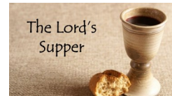
The Lord's Supper

The Lord's Supper will be celebrated Sunday, January 9, in both services.