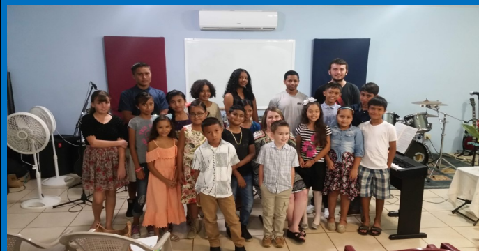
Ashley's Piano and Voice students