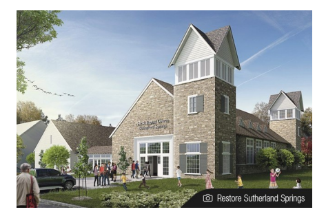
First Baptist Church of Sutherland Springs Building Dedication & Grand Opening

Sunday, May 19th at 11am Free Lunch 216 4th Street, Sutherland Springs