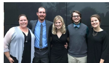
The Herald's Trust Interns